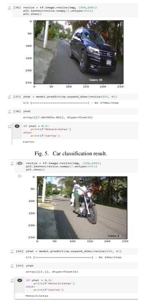
Fig. 6. Motorcycle classification result.

The model achieved high accuracy and the results were clearly visualized. By resizing the input image to 256 by 256 pixels and displaying it using Matplotlib, the classification model was able to assign a label to the image, accurately identifying it as either a motorcycle or a car. This convenient display of both the resized image and its classification result on a single screen greatly facilitated the evaluation and verification of the model's classification capabilities, as shown in Figures 5 and 6.