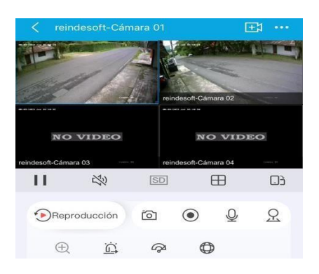
Fig. 3. Video security cameras.

All this infrastructure was implemented and configured so that the system containing the Deep Learning module could perform vehicle classification using a previously trained neural network model (Figure 3).